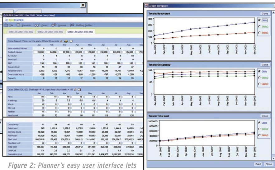
Figure 2: Planner's easy user interface lets you quickly analyze different scenarios over long time horizons.